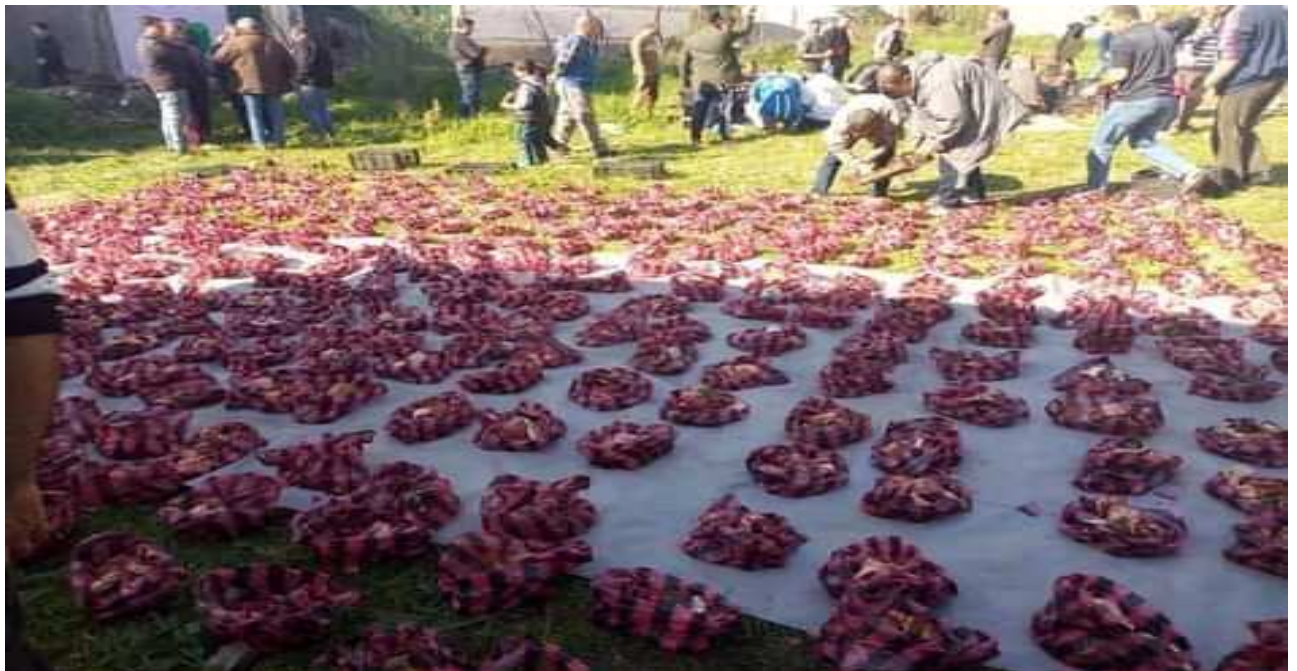
Timecređt ( Luziđa ) n temnađt n Xerrađa