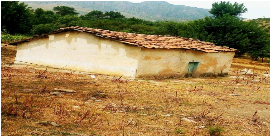
Lemqam n Sidi Eli Uccen