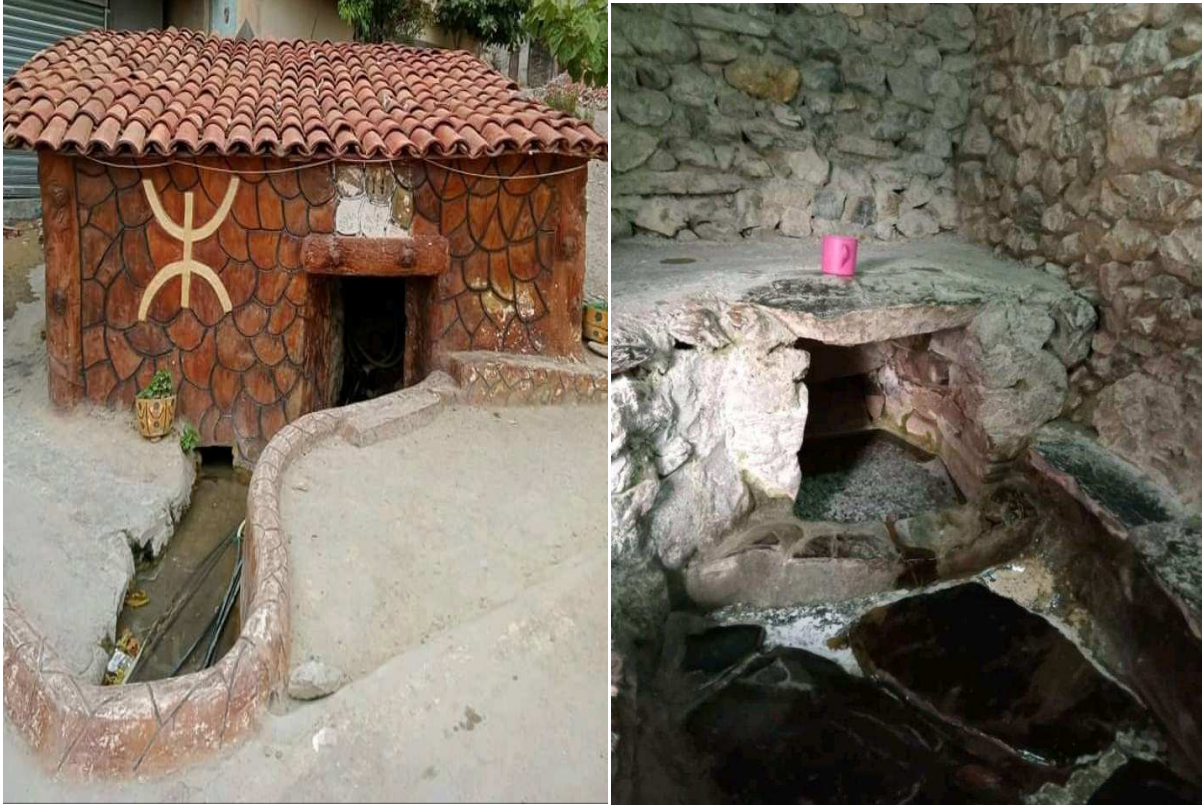
Tala n Xerrata ( Buyazran )