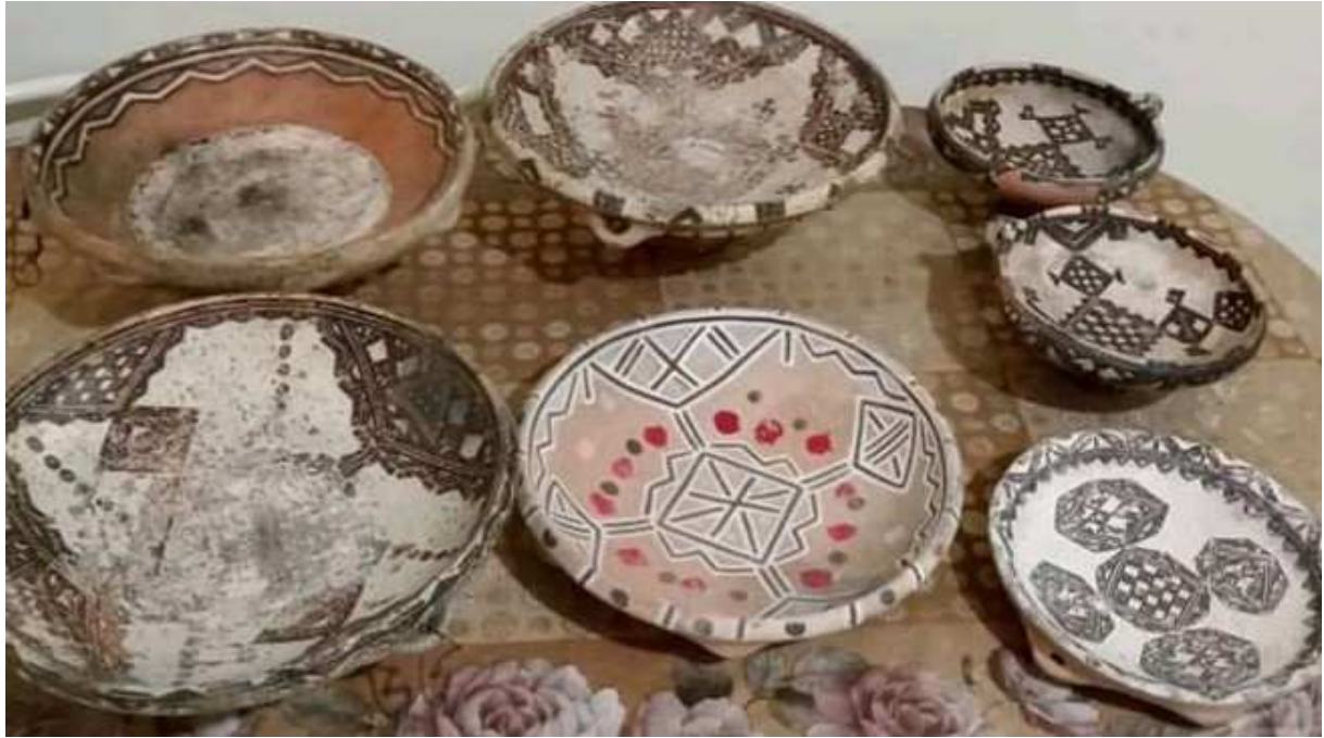
Afexar n temnađt n Xerrađa ( Buyazran )