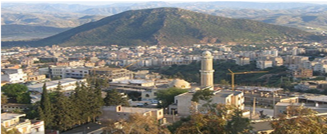
Tugna n temnađt n Wuqbu