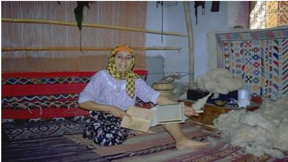
Tugna 2 » : Aqerdec n taduț