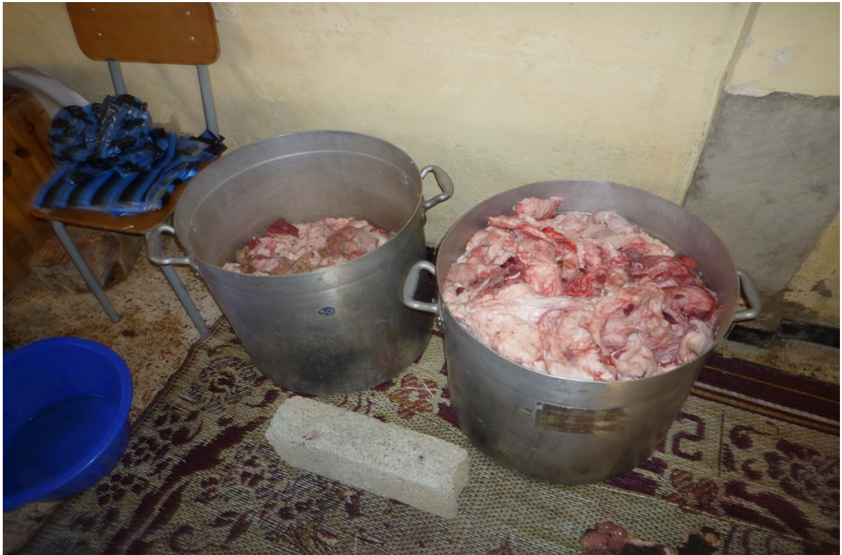
Tugna18: tikkerciwin akk d wayen yellan daxel n usejmi