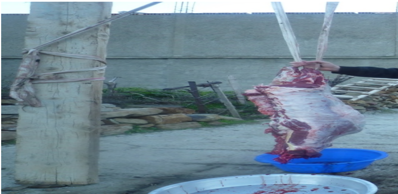
Tuggna13: azelaq n yimeslax