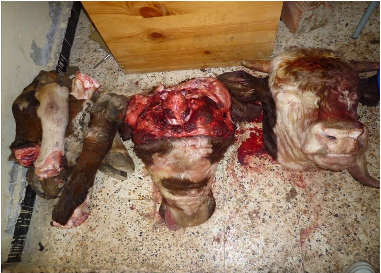
Tugna 16 : iqarray akk d yiqejiren-nni n yezgaren