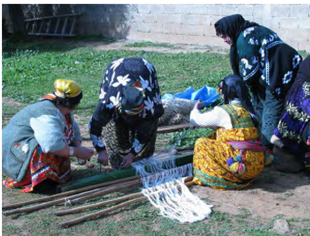
Tugna 26 : axeddim n rruț n uzețța