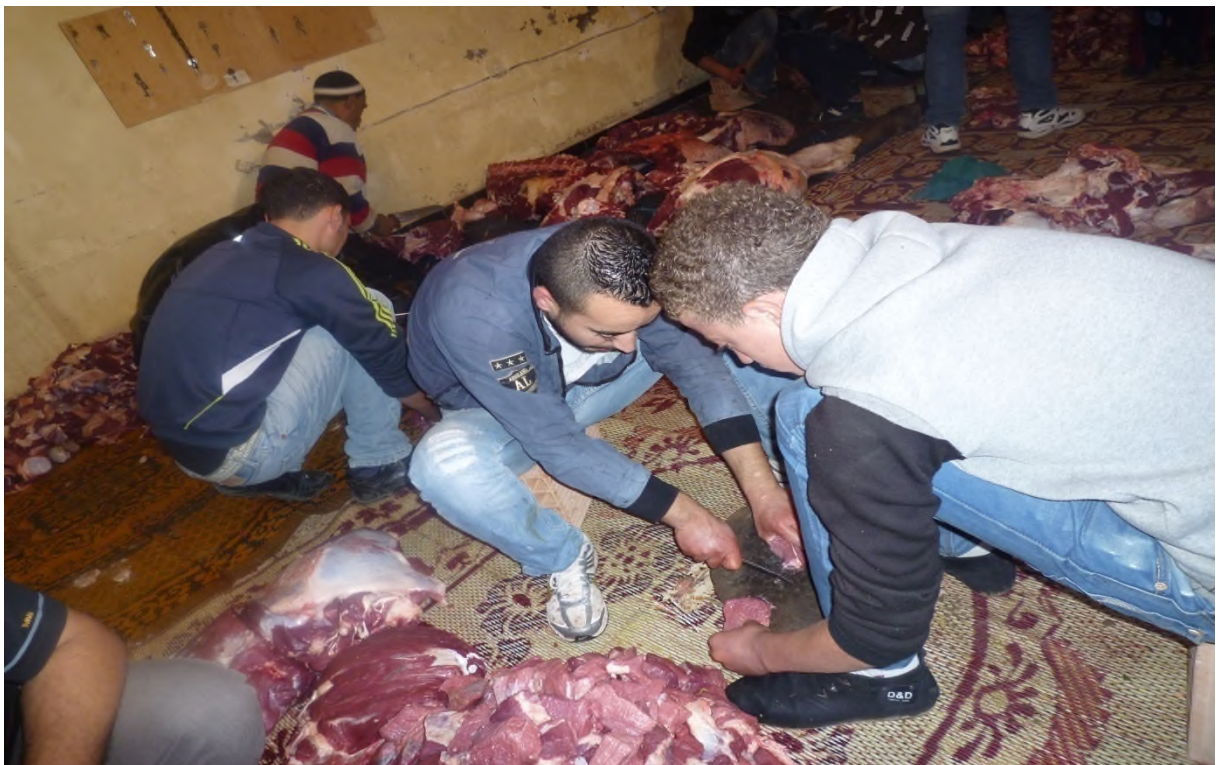
Tuggna 19: agezzum n weksun d imersumen