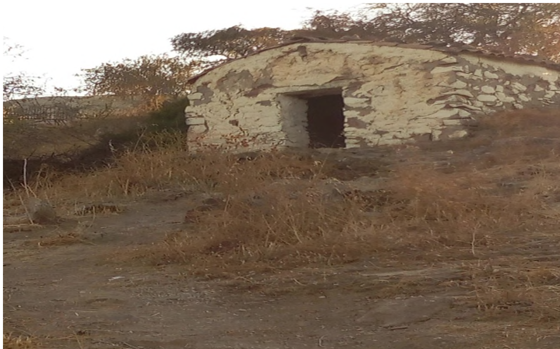
Tugna 11: yemma takbucit (ḥekkun-d dakken zik mi ara tzeṭel ur dewwit ara lgerra ttruḥun ad seḥḥen dina seksu ad dżun akken ad ewwet lgerra qqaren-d dakken asirem aneggaru ad tebdu tyita n lgerra).