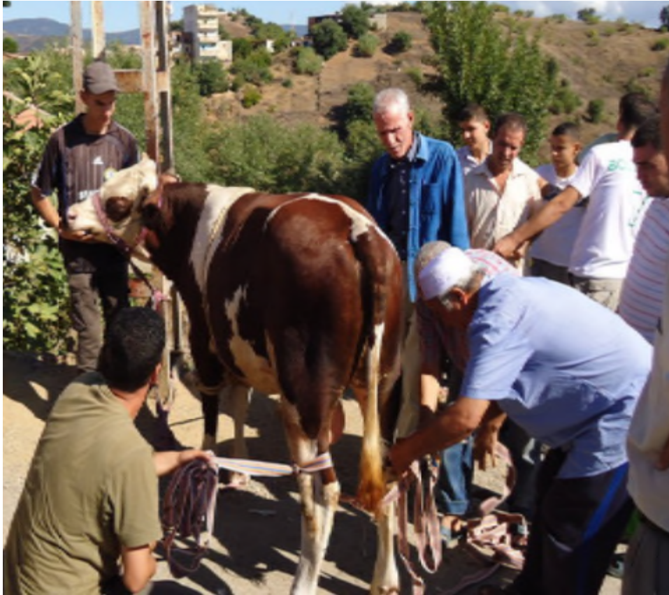
Tuggna12: aheyi n uzejmi