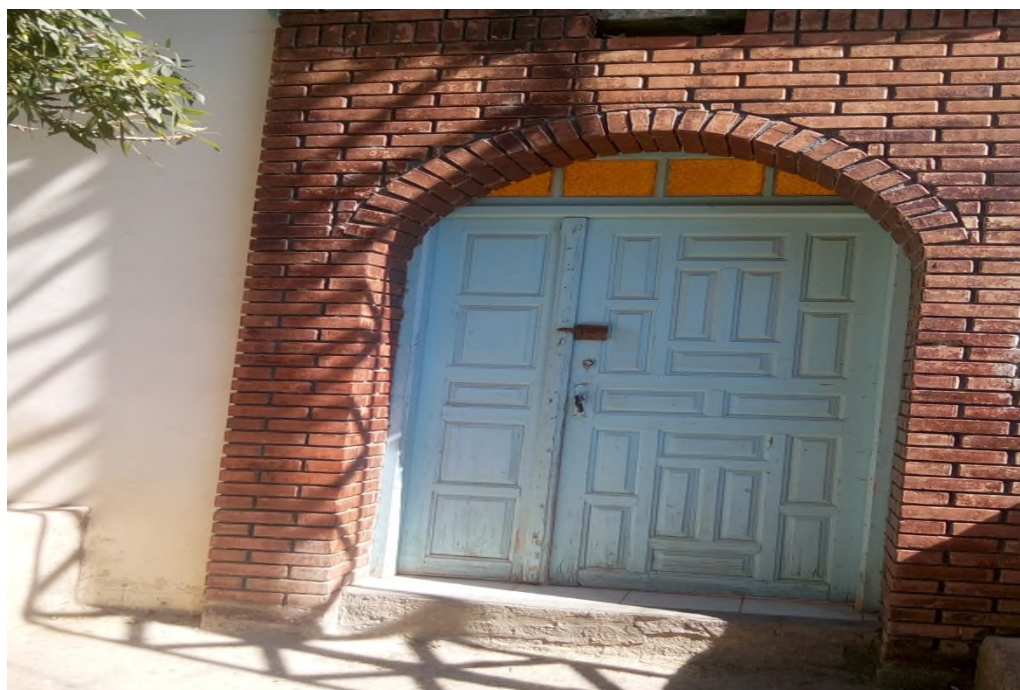
Tugna 08 : lemqam n carfa