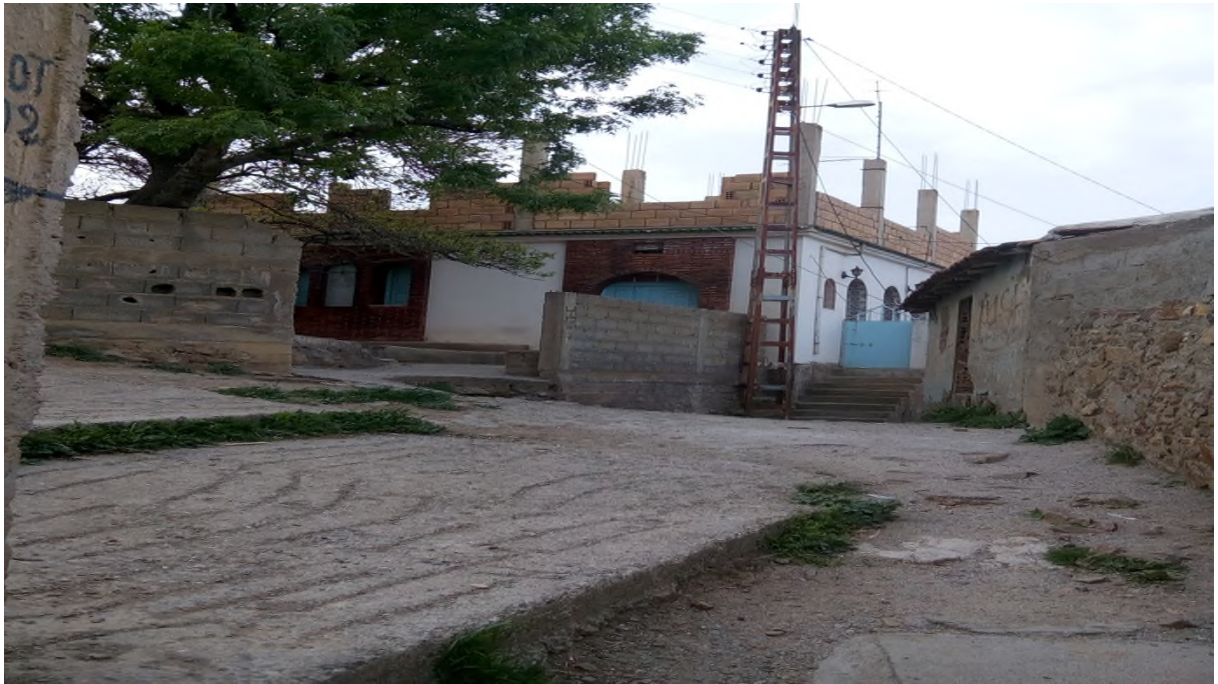
Tugna01 : Tajmašt n taddart akk d lğamas n ccerfa