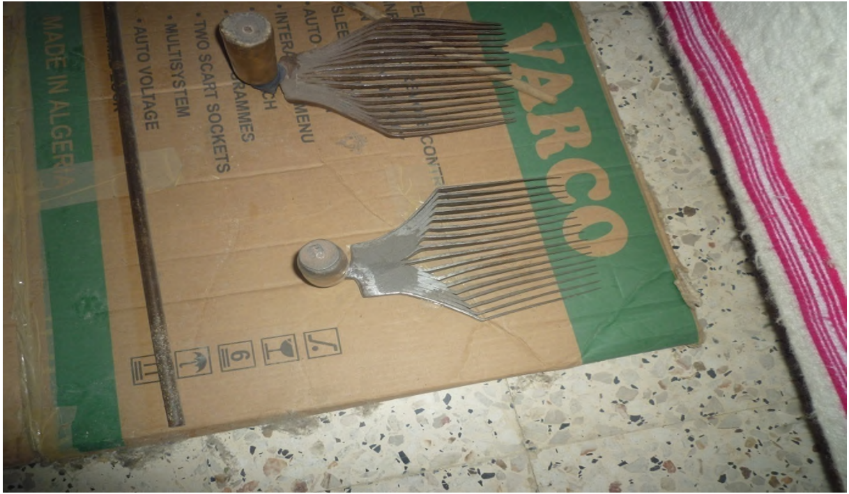
Tugna 29: tayazilđ s yes i xeddmn