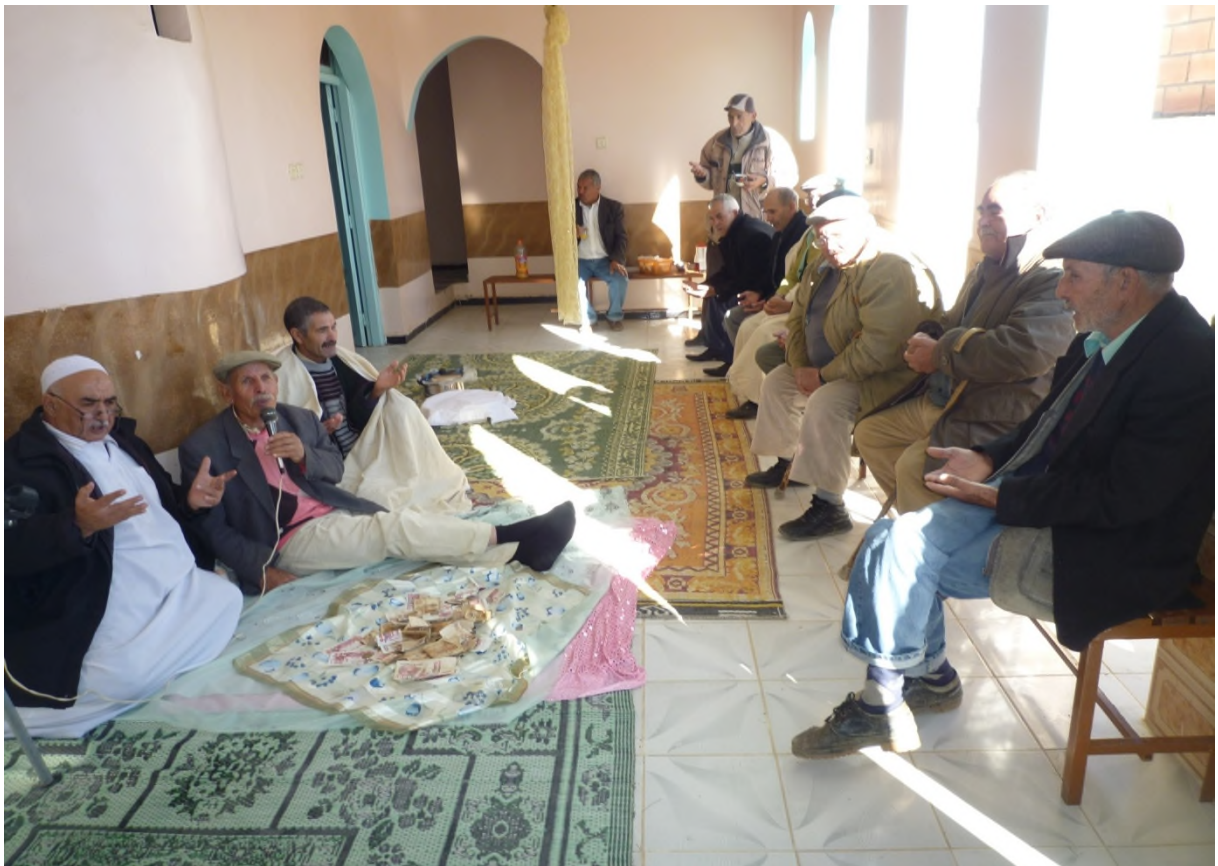
Tugna 17: aggraw n ccarfa