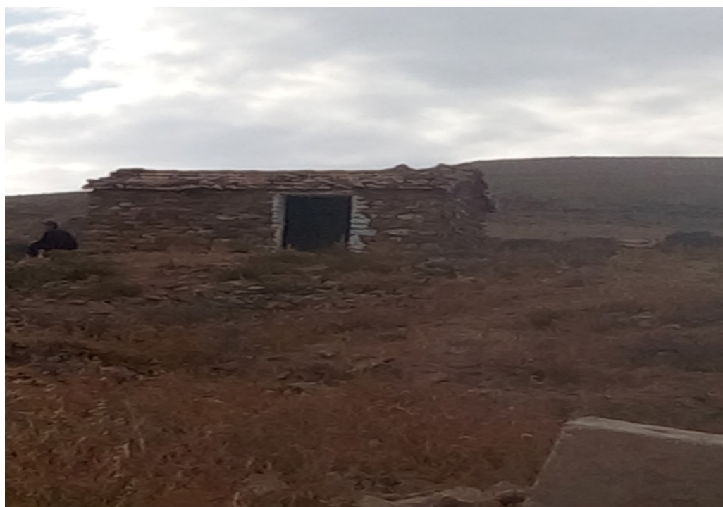
Tugna 10 : lemqam n mmis n sidi Slimane