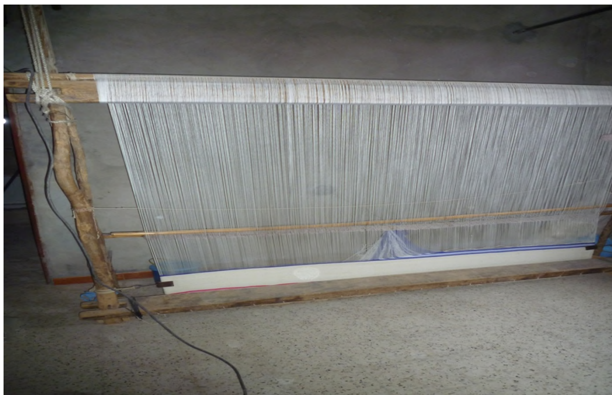
Tugna 28: azetta yebda xedmen deg-s