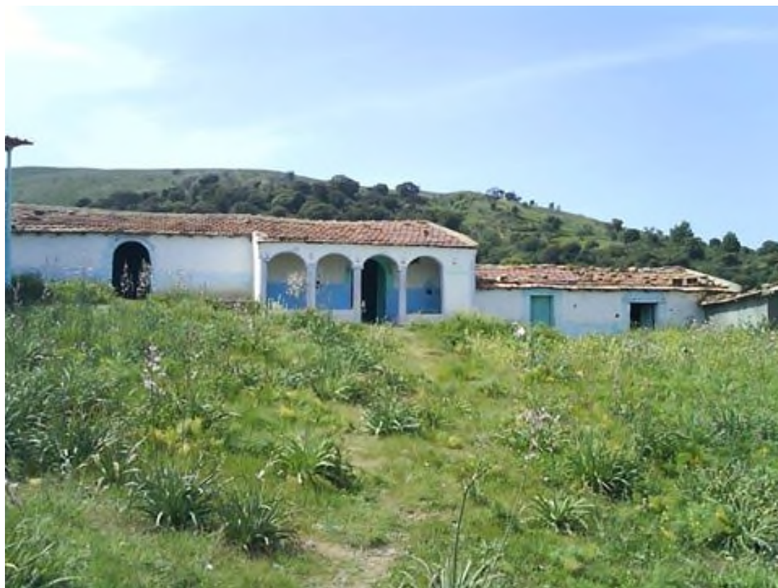
Tugna 07: Lemqam n sidi mhend ameqran