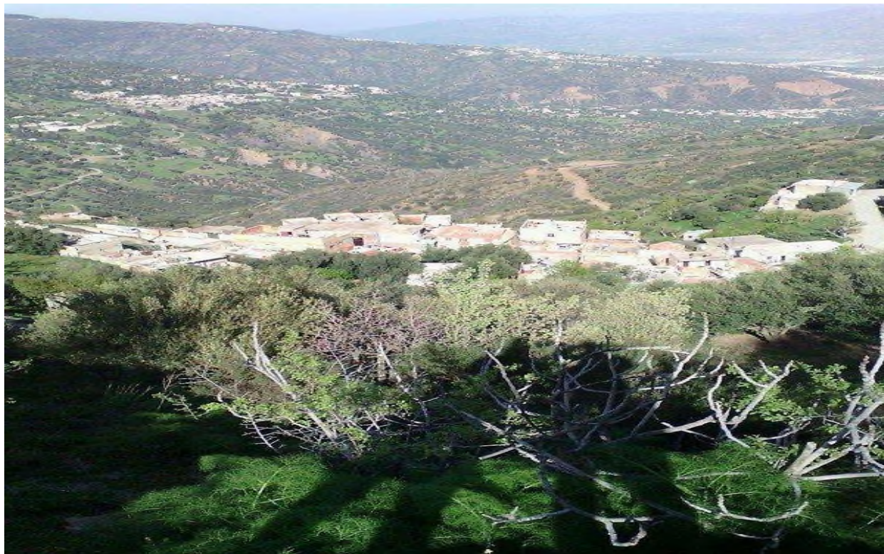
Tugna05 : Taddart izezzunen seg ussawen