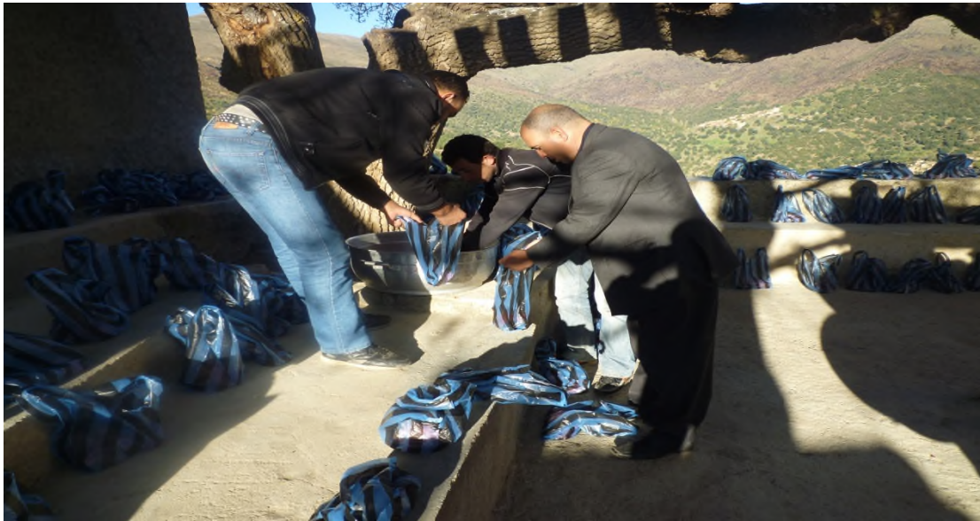
Tugna 20: ferruq n weksu d tixxamin