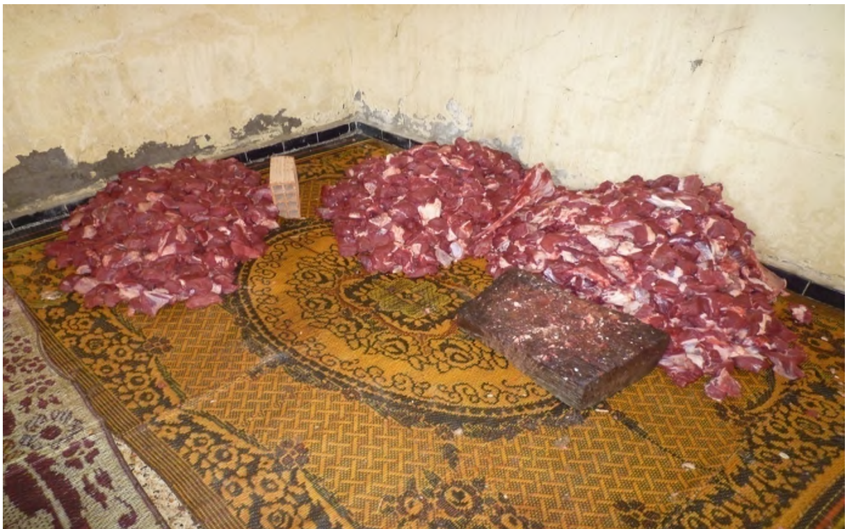
Tuggna15: tirac n weksun ambazd mi yettwagzem