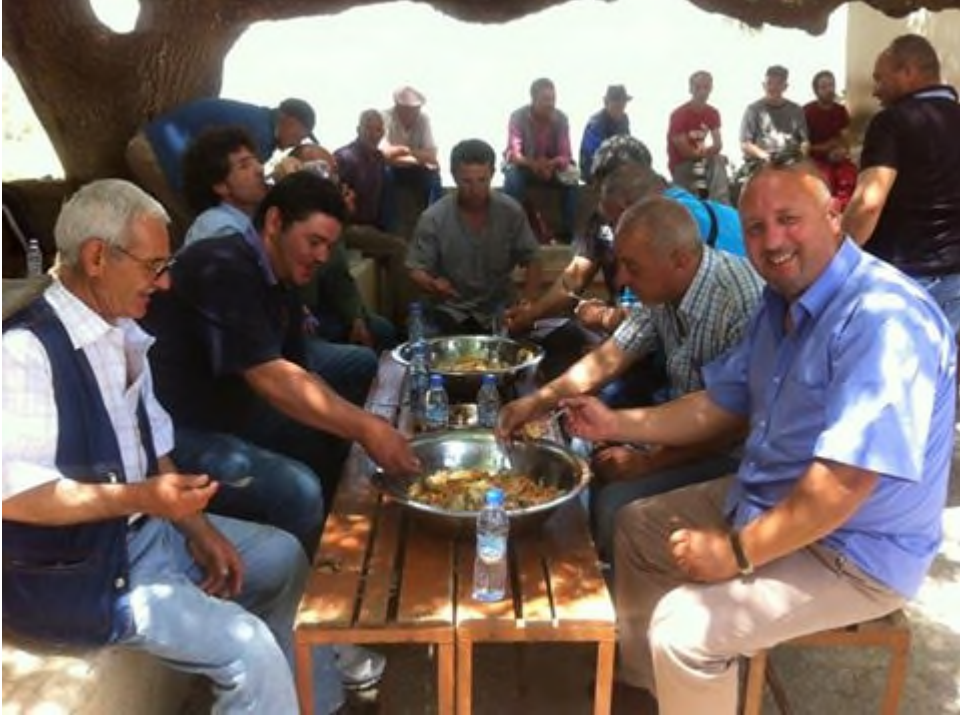
Tugna 22: Aseti deg tejmast n taddart