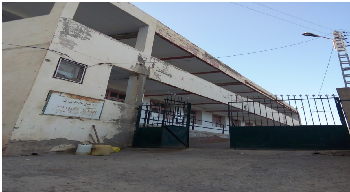
Tugna06: ayerbaz amezwaru n taddart izezzunen