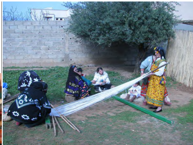
Tugna25 : tugra n uéçța