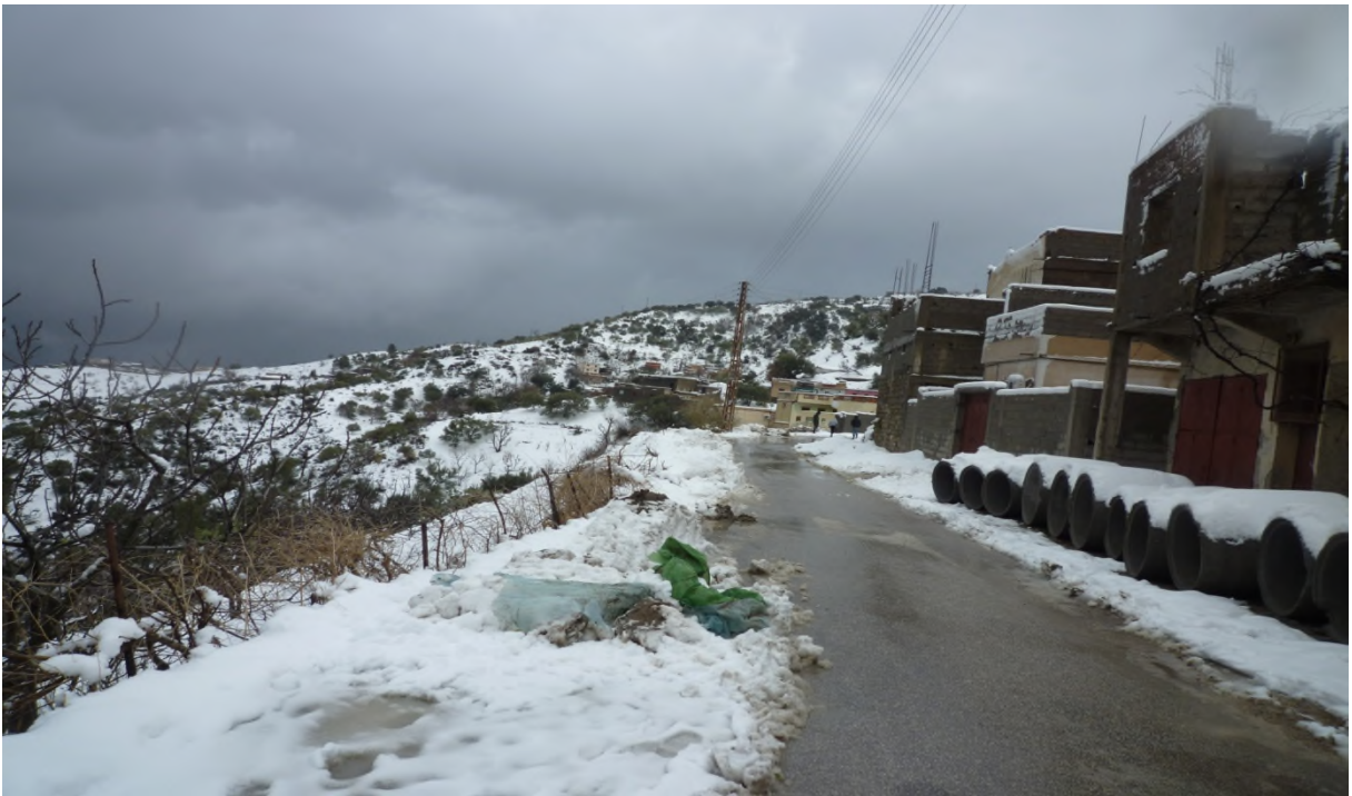
Tugna04 : taddart n Yizezzunen teçcur d adefel