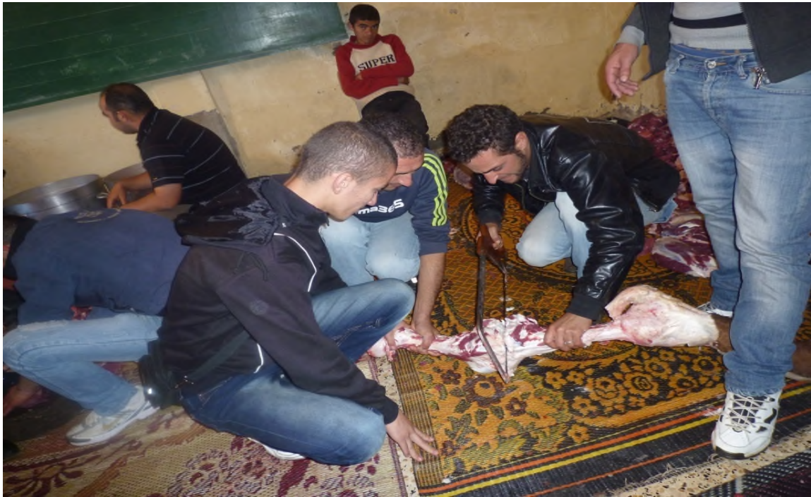
Tuggna 14: agezzum n weksun deg taddart