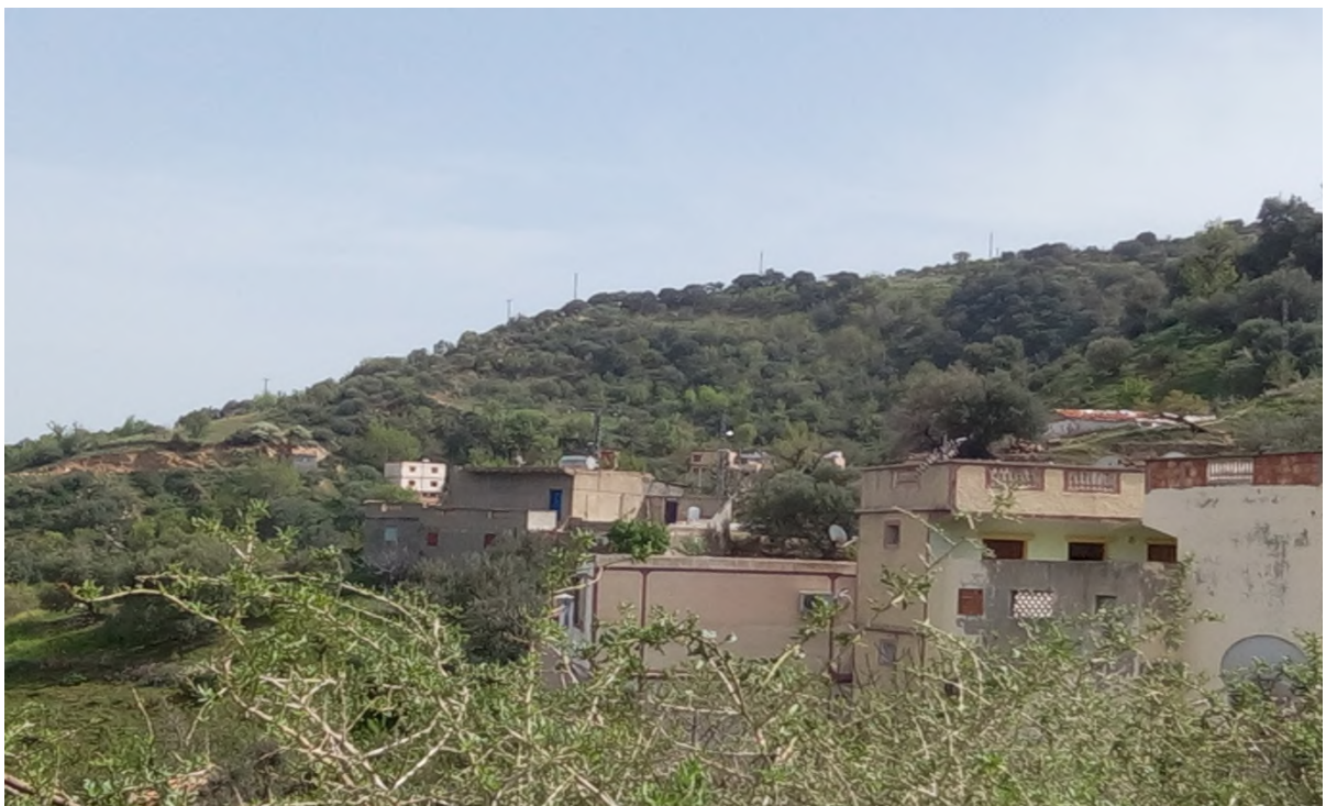
Tugna02 : Taddart n izezzunen s ubrid n ugnu qqasi