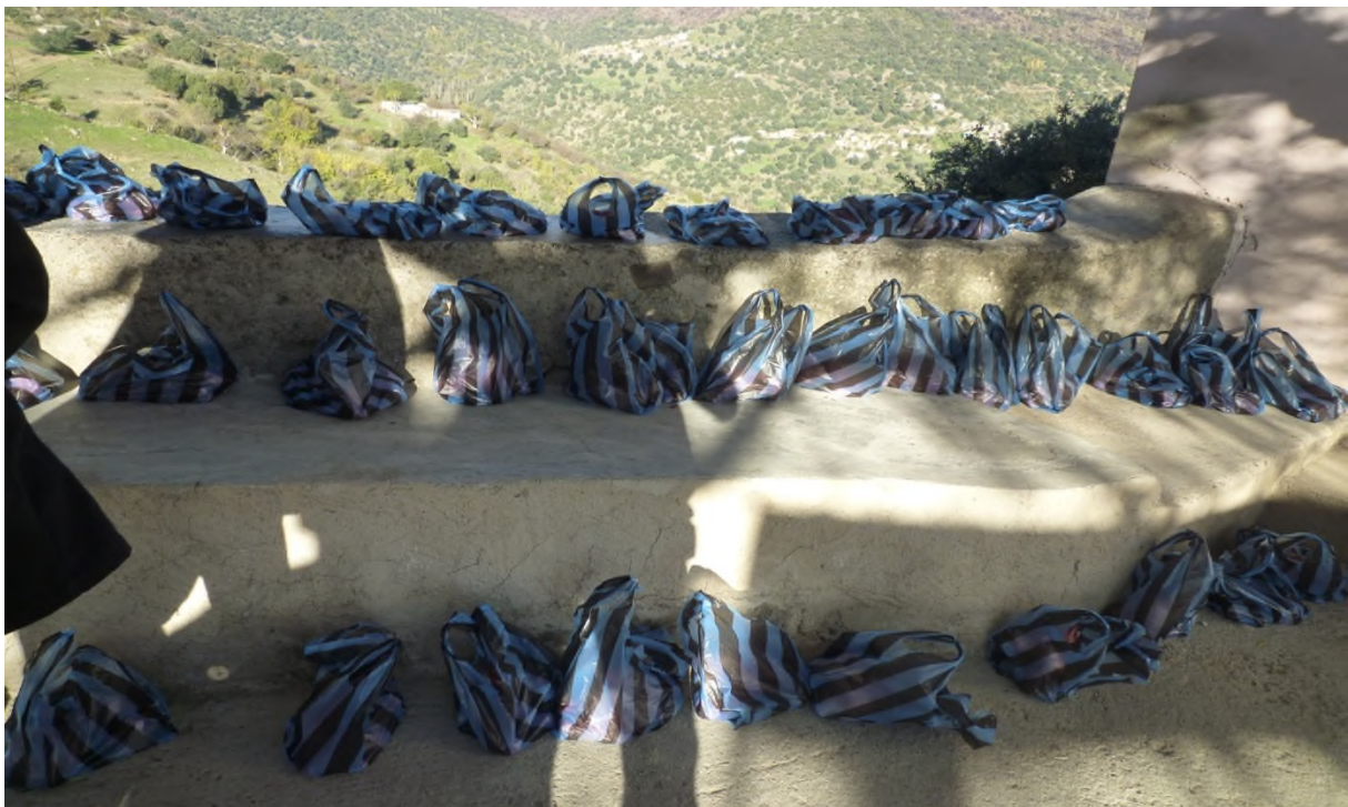
Tugna 21 : tixxamin n weksu