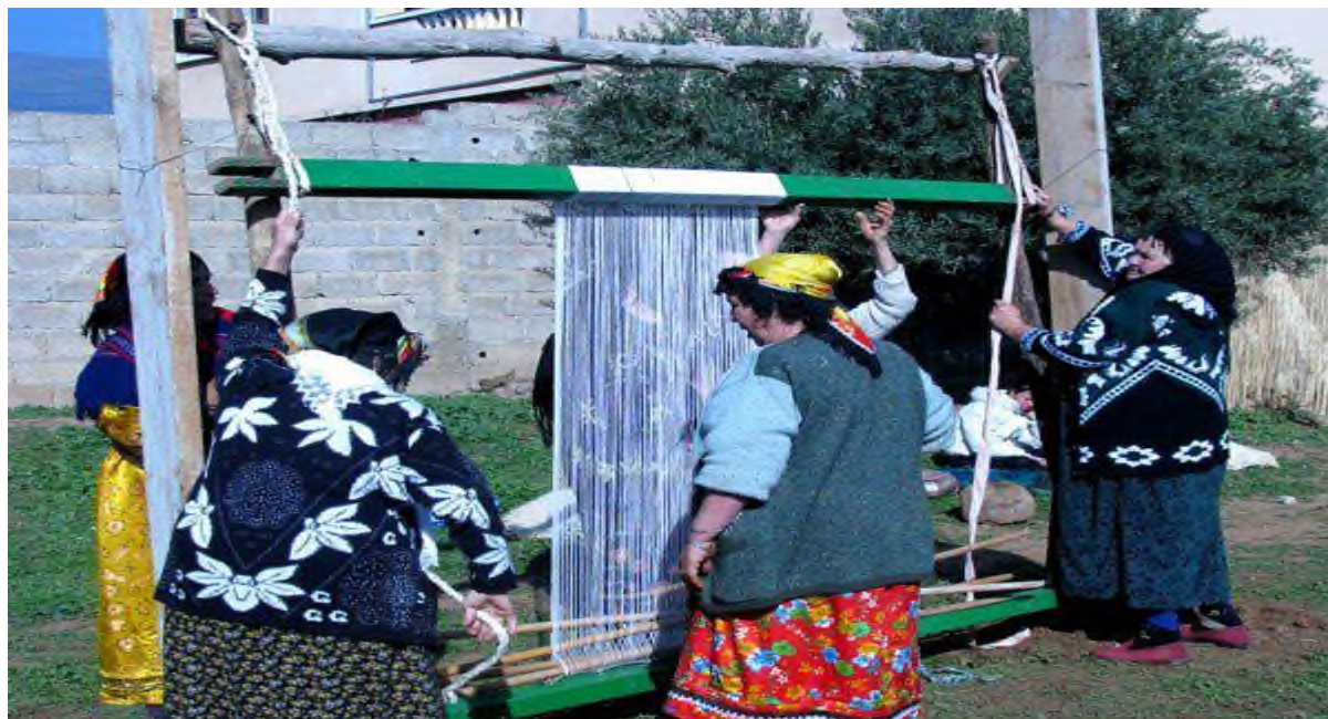
Tugna 27: azellaq n uzetä