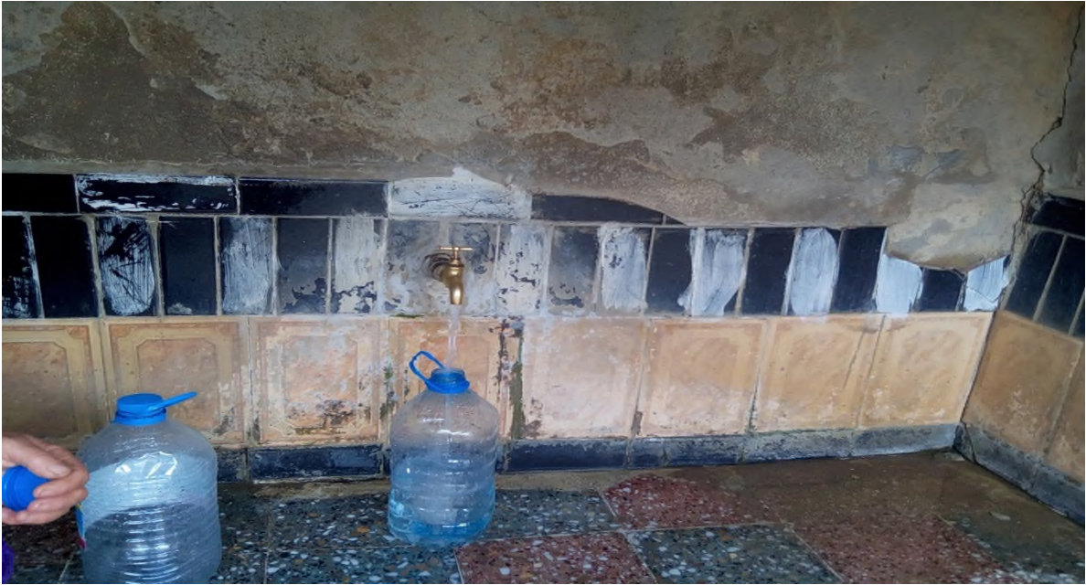
Tugna03 : tala n taddart