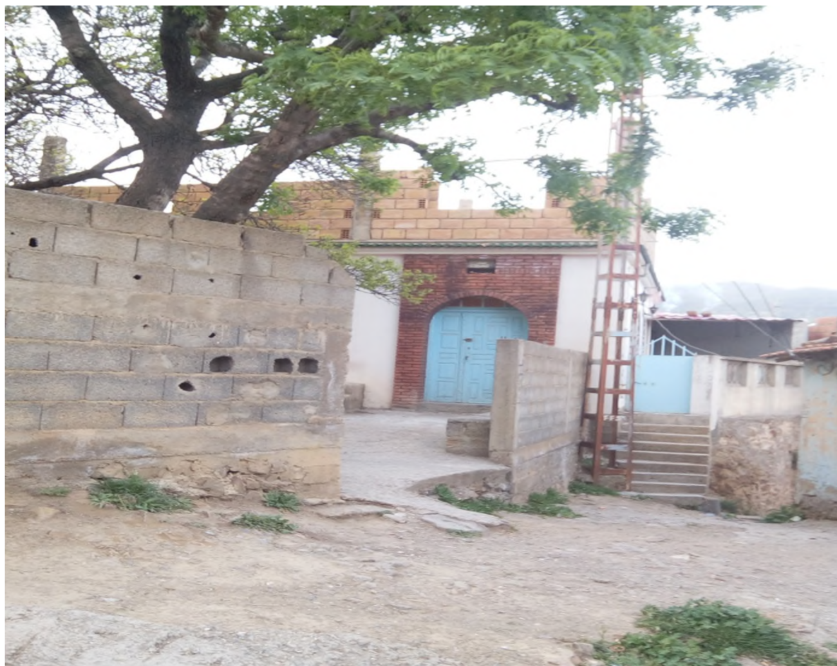
Tugna09 : lemqam n carfa tirni