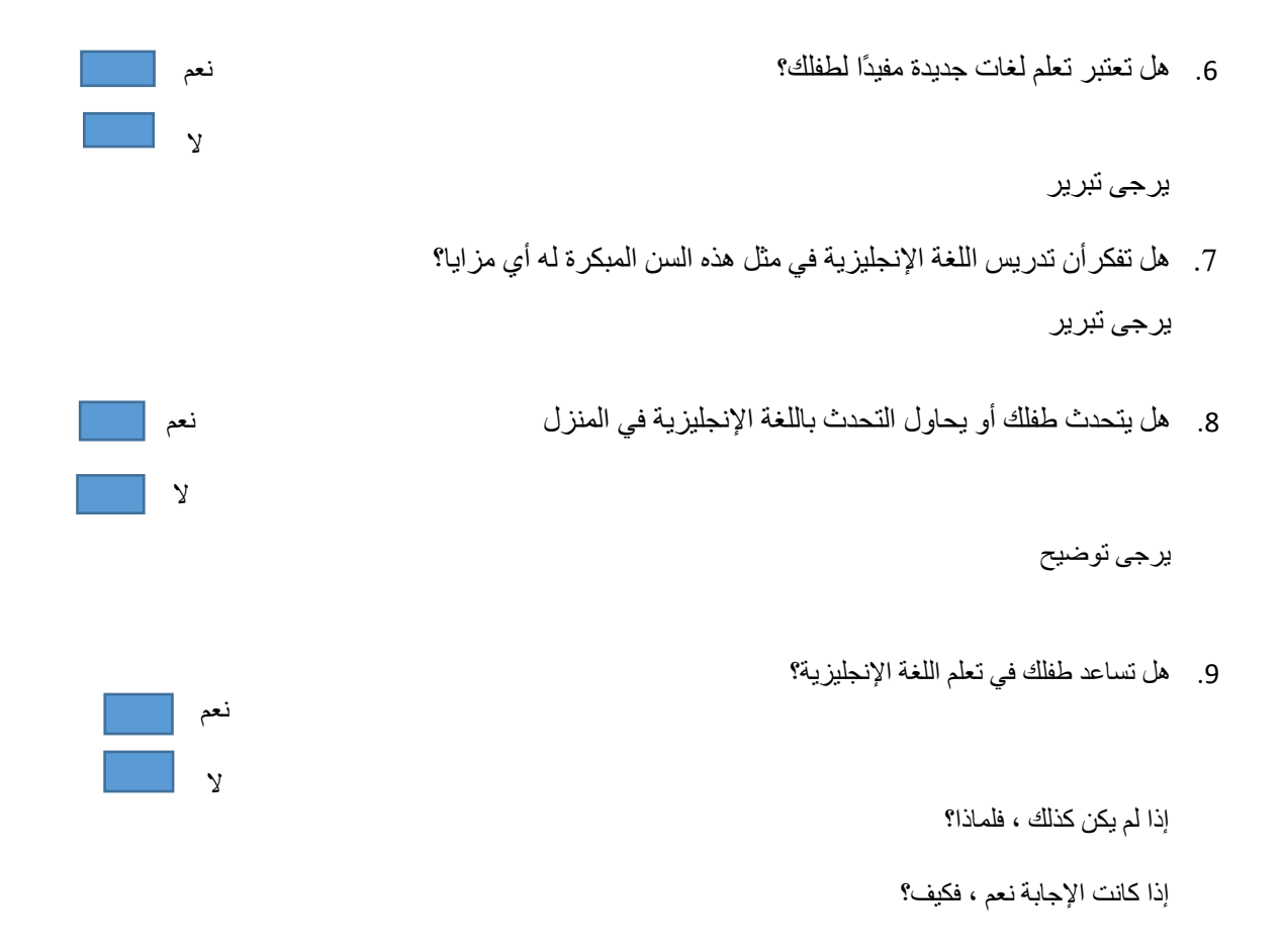
الجزء 03: اقتراحات أخرى

إذا كان لديك أي تعليقات أو آراء أو اقتراحات أخرى، يرجى مشاركتها معنا، فإننا نقدر ذلك كثيرًا